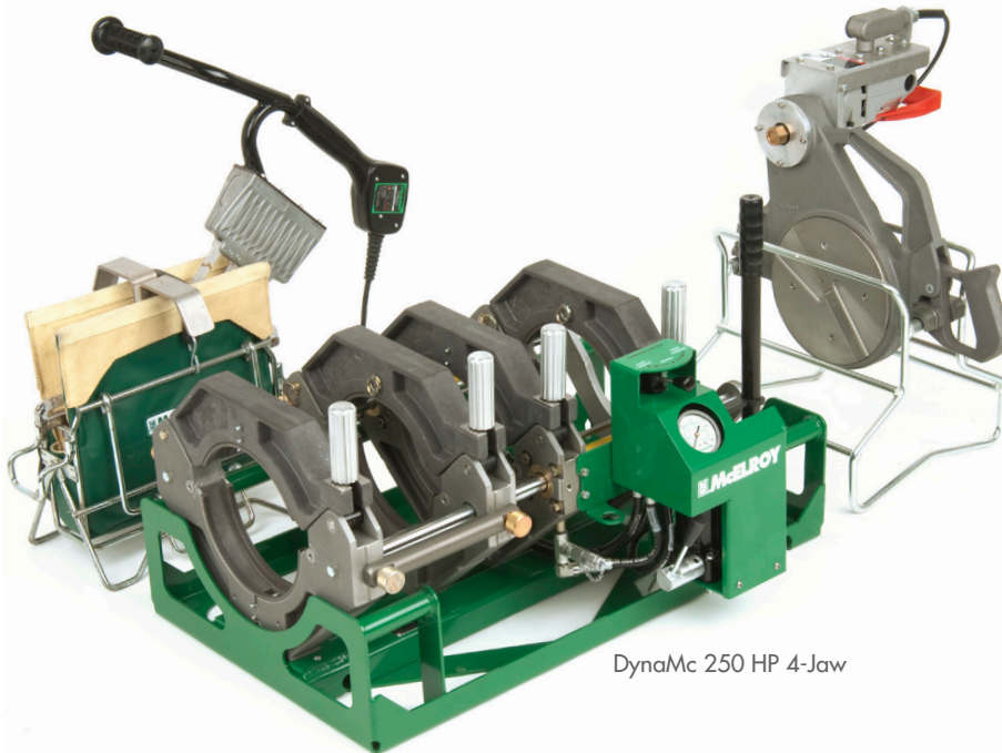
DynaMc 250 HP 4-Jaw

Fusion Capability for 63mm - 250mm (2" IPS to 8" DIPS)